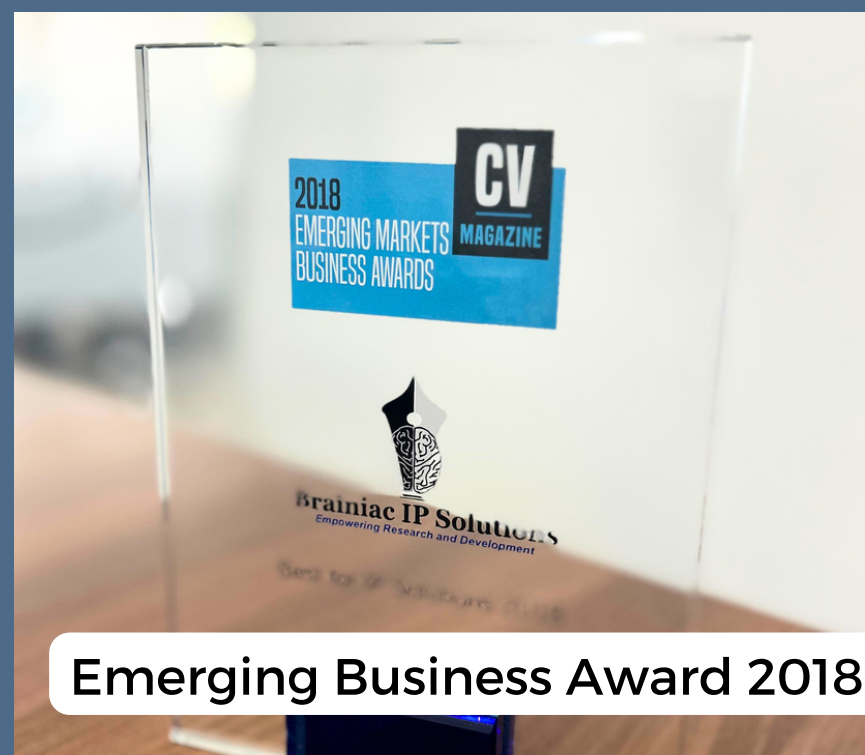
Emerging Business Award 2018