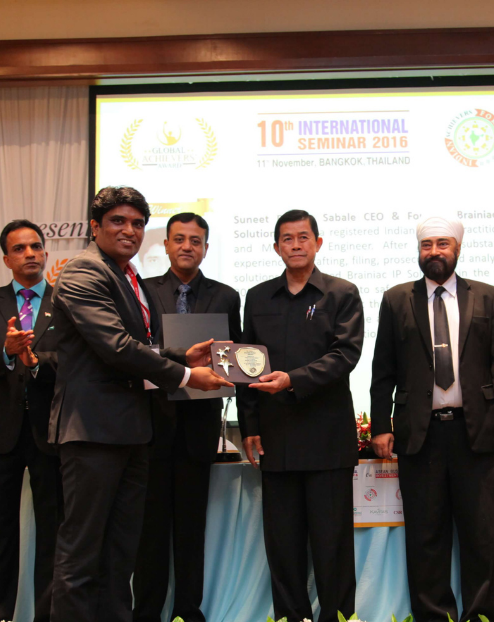
GLOBAL ACHIEVERS AWARD -2016