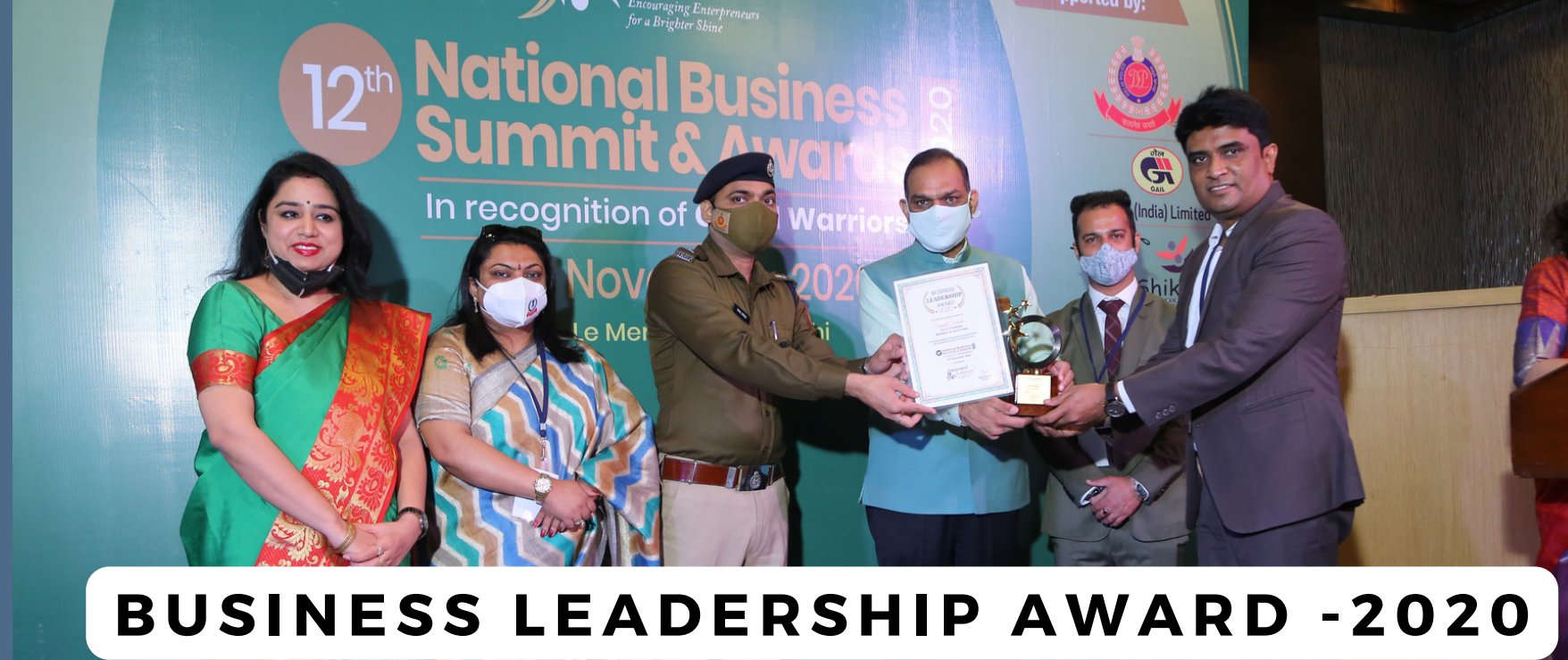
BUSINESS LEADERSHIP AWARD -2020