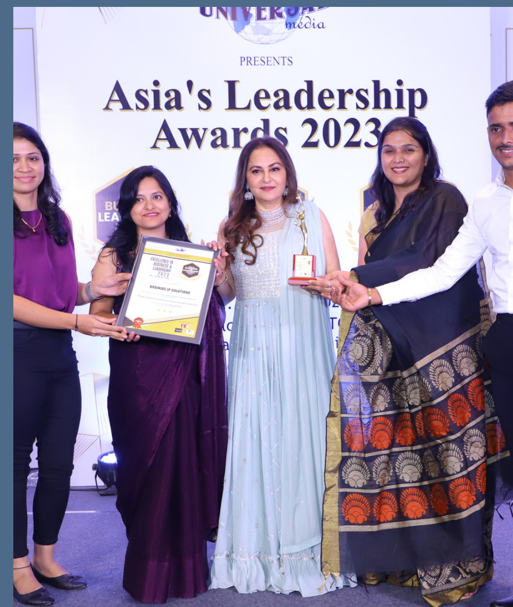
Asia's Leadership Award -2023